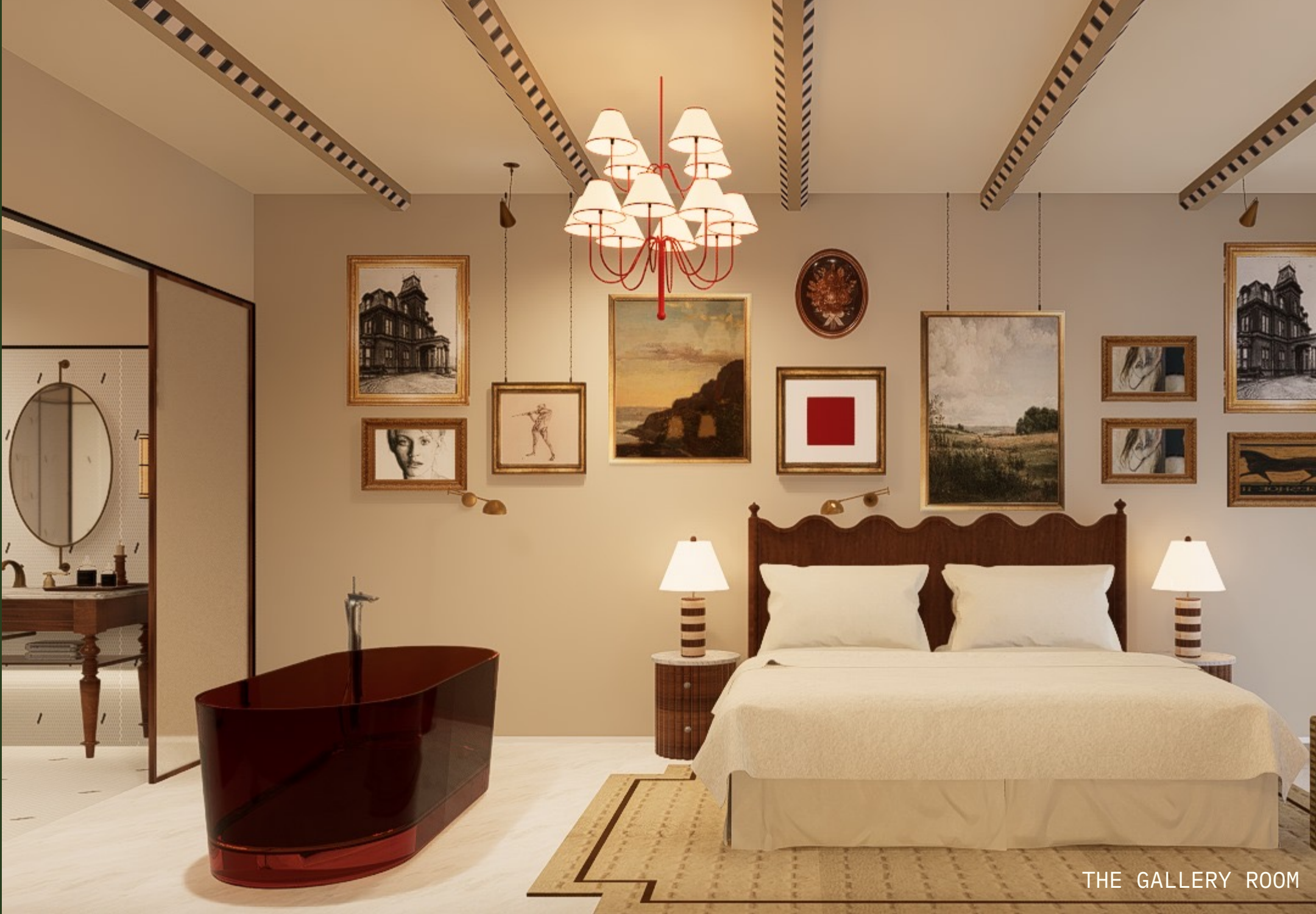
THE GALLERY ROOM